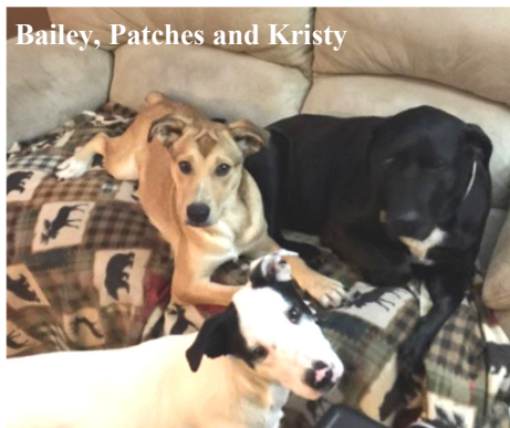
Bailey, Patches and Kristy

We are overflowing with kittens! There is nothing cuter than a pile of romping kittens. Come to the Haven to get a couple to liven up your home.